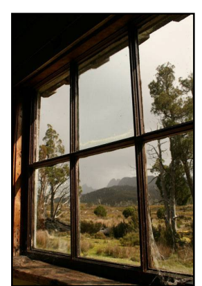
Mt Kate Hut Residence Cradle Mountain