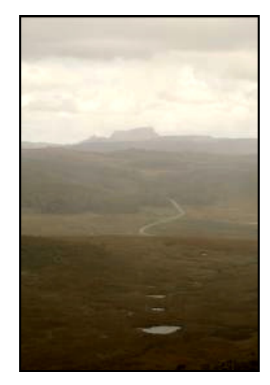
The Vale of Belvoir